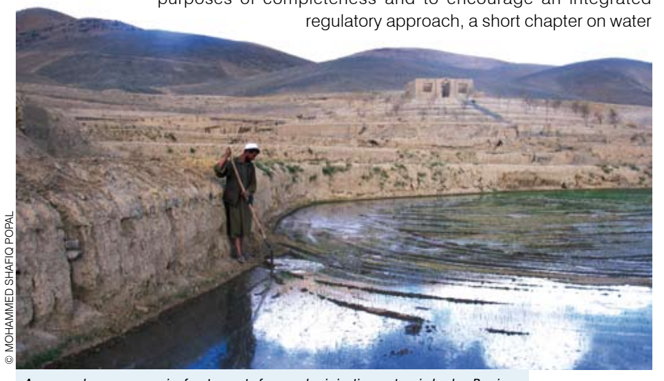
A man works on a reservoir of water, part of a complex irrigation system in Loghar Province.

The Water Law, which addresses institutional and management issues and regulates uses and users of Afghanistan's water resources, is currently in the legislative process and will become law once approved by the National Assembly. Nevertheless, for purposes of completeness and to encourage an integrated