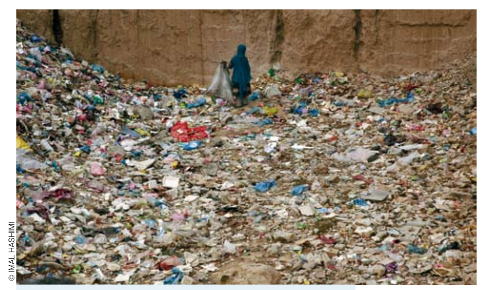
A girl scavenges for metal, plastic and food in a huge pile of waste in a construction area where a foundation for a new building has been dug, Kabul, Afghanistan.

With this in mind, it was clear that an appropriate law to govern environmental management issues was an immediate need for Afghanistan's post-conflict Government. For this reason, the newly-established National Environmental Protection Agency (NEPA) with the support of the United Nations Environment Programme (UNEP) regarded the development and promulgation of the Environment Law as a necessary and urgent priority.