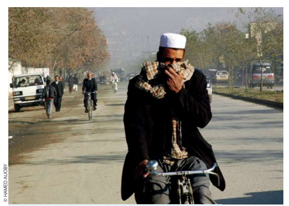
A cyclist tries to avoid inhaling Kabul's air. The poor air quality, resulting from vehicle emissions, dust and smoke from burning wood and other fuels for cooking and heating, is having significant negative impacts on human and respiratory health in the city.