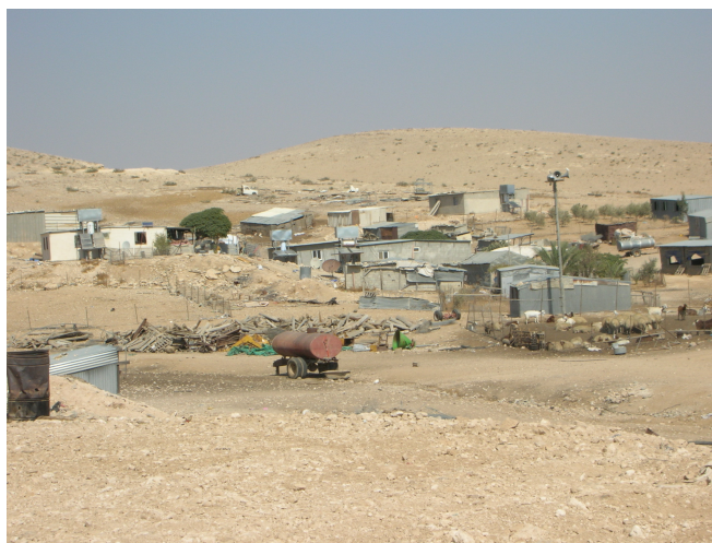
The unrecognized village of Tal A'rad

planned towns, and one regional council, the Abu-Basmaa Regional Council, which currently consists of around five villages. The number of villages in the Abu-Basmaa Regional Council will be increased to nine in the near future. The Bedouin living within the Government planned townships are among Israel's poorest socio-economic group. These communities are characterised by low levels of employment, poor infrastructure, sub-standard facilities and services, and high levels of poverty, currently causing an outward migration primarily back to the villages. As of February 2008, a number of the recognized Bedouin towns had only partial or non-existent sewerage systems including neighbourhoods in Ar'ara, Kuseife and Laqye and water and electricity supplies are of a very low standard. 87 The city of Rahat, the biggest of the recognized Bedouin localities, has Israel's lowest proportion of 20-29 year olds studying at an academic institution. 88