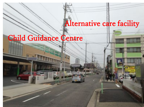
Alternative care facility