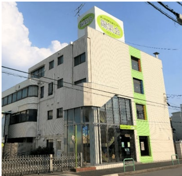
Alternative care facility ‘YokiDojo’