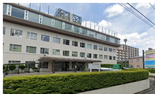
Morioka Child Guidance Centre

I cannot allow the CGC to destroy our cosy and peaceful family under the guise of 'family support'.